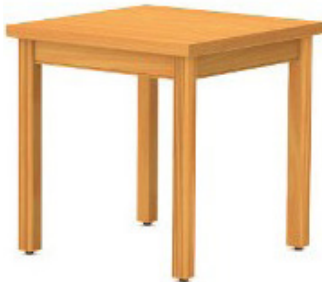
Montgomery End Table #MNTG-3051 W22" L22" H22"