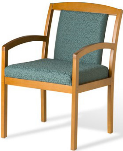
Stafford II Chair 3/4 Upholstered Back #35340, #35003