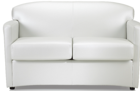
W53.5" D30" H32.5"