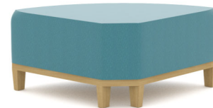
Corner Wedge W48.5" D31" H18" ALII CW01