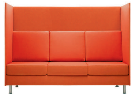
Segmented back cushions no stitching W72" H53"