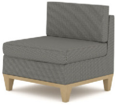
Armless Chair W28.5" D28.5" H33" AL C002