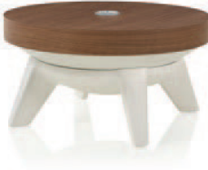
Power in Table