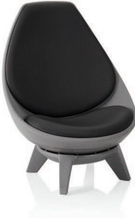
Granite Grey Poly Shell/Base