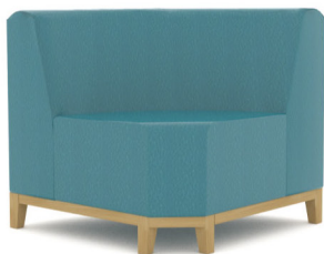
Armless Corner Wedge W48.5" D31" H18"