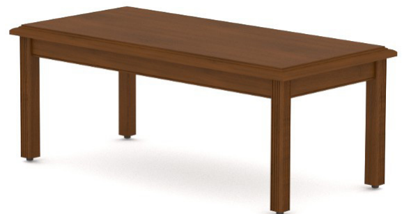
Commonwealth Coffee Table #3327 W22" L42" H16"

Lounge tables that are both functional and stylish