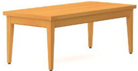
Montgomery Coffee Table #MNTG-3057 W22" L42" H16"