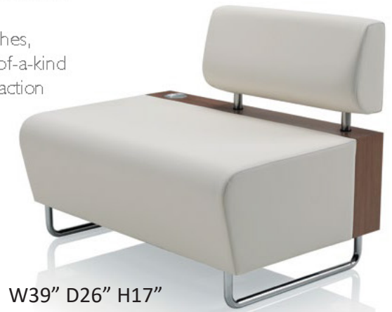
W39" D26" H17"

With Shibby you can break down barriers and build centers for activity instead. Easily frame open spaces and transform them on your own terms with your unique blend of imagination, style and sophistication. Shibby gives you the freedom to bring your vision to life. Its clean lines and subtle curves create a low-slung modern aesthetic leaving space for your creativity to flow.