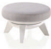
Ottoman W27.25" D27.25" H17.5"