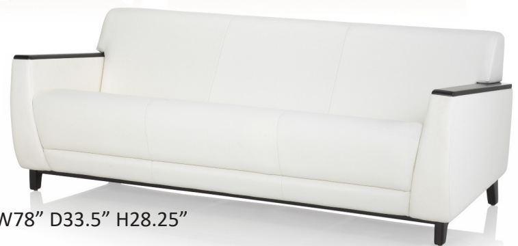
W78" D33.5" H28.25"