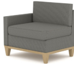
Left Arm Facing Chair W32" D28.5" H33" AL C006