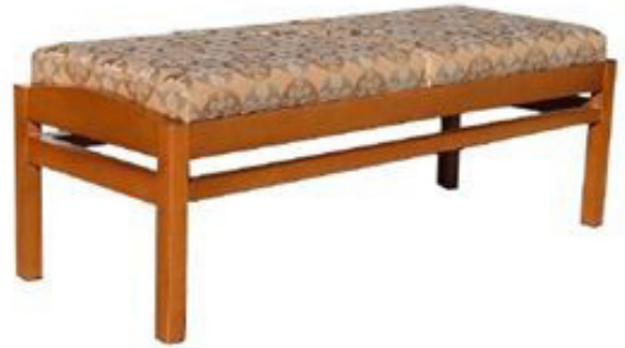
Stafford II Bench Upholstered Seat #35001