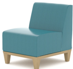
Armless Chair W28.5" D28.5" H33" ALII C002