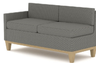
Left Arm Facing Loveseat W61.5" D28.5" H33" AL LS01