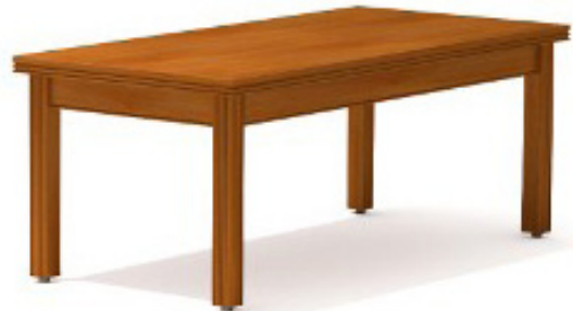
Old Dominion Coffee Table #3821 W22" L42" H16"