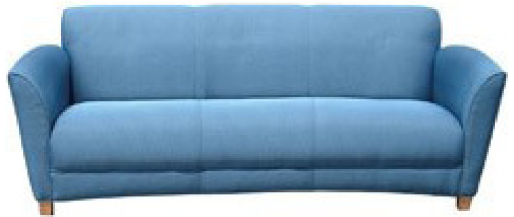
Old Dominion Lounge Sofa #26002