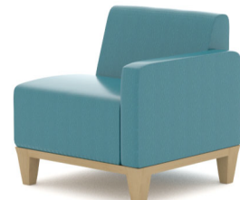
Right Arm Facing Chair W32" D28.5" H33" ALII C005