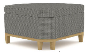
Corner Wedge W48.5" D31" H18" AL CW01