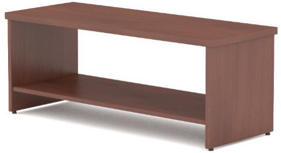
Piedmont Coffee Table #34029 W22" L42" H16"