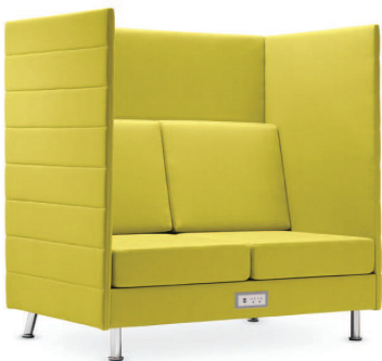
Integrated power channel stitching W60" H53"