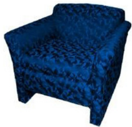
Hanover Lounge Chair #3933