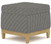
Ottoman W28.5" D28.5" H18" AL OT00