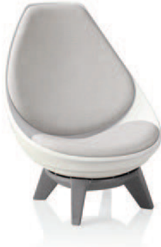
Contrasting Poly Shell/Base