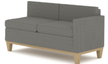
Right Arm Facing Loveseat W61.5" D28.5" H33" AL LS02