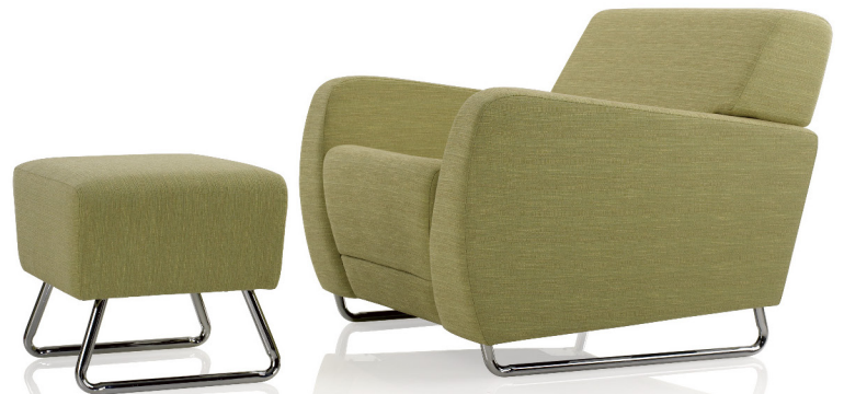
W18" D26" H18"

Whether you add Suavé to healthcare, educational, or business settings, you will find it's informal style encourages relaxed and supportive communication. Who couldn't benefit from a little more of that?