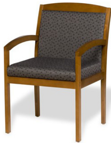
Stafford II Fully Upholstered Back #35350, #35341