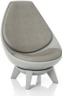
Cool Grey Poly Shell/Base