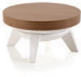
Table W27" D27" H14.5"