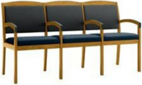
Stafford II Three Seater Bench Upholstered Back #35031