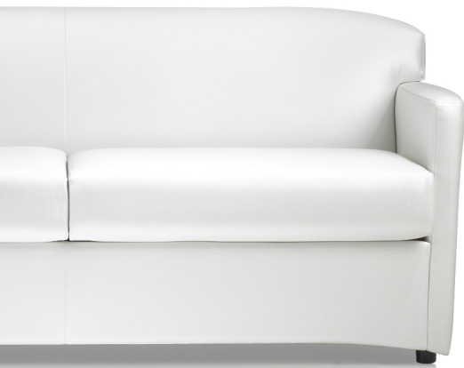
W75.5" D30" H32.5"