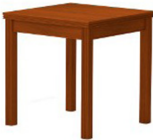
Old Dominion End Table #3852 W22" L22" H22"