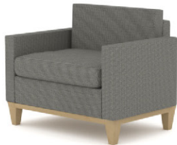
2 Arm Chair W35.5" D28.5" H33" AL C003