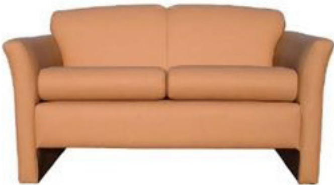
Hanover Lounge Loveseat #3931