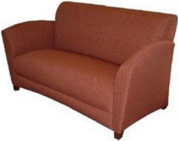
Old Dominion Lounge Loveseat #26020