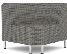
Corner Wedge w/Back W48.5" D31" H18"