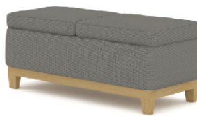
Bench W57.5" D28.5" H18.5" AL B001