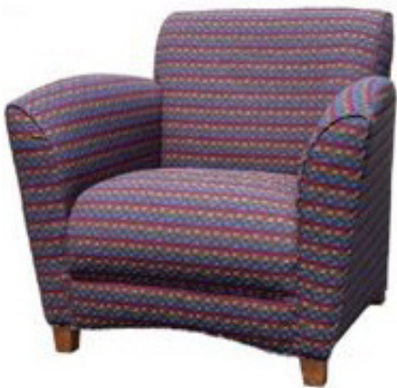
Old Dominion Lounge Chair #26001