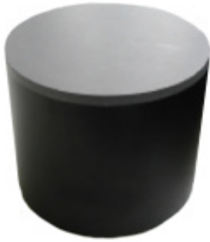
Piedmont Drum Table #3216 DIA24" H20"