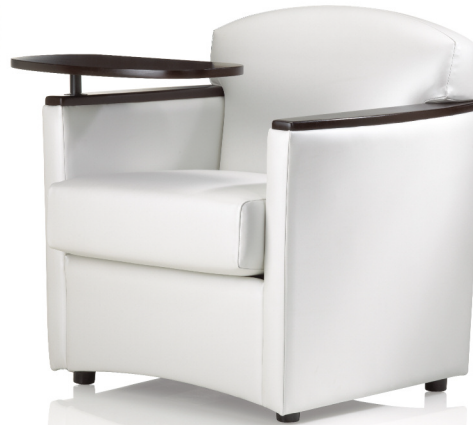
W31.5" D30" H32.5"