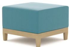
Ottoman W28.5" D28.5" H18" ALII OT00