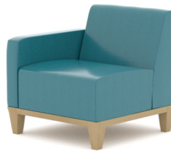
Left Arm Facing Chair W32" D28.5" H33" ALII C006