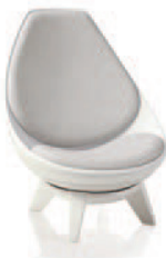
Chair W33" D32.5" H41.75"

Experience the personalized comfort of Sway. The first of its kind, Sway lounge seating breaks free from conventional movement and enables dynamic orbital motion. Move front to back, side to side and everywhere in between with a smooth 360-degree swivel. Instead of a lounge chair that forces you to adapt, Sway adapts to you, responding to your natural body movements to provide superior comfort.