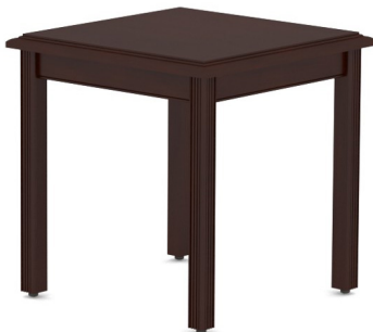
Commonwealth End Table #3327 W22" L42" H16"