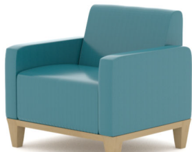
2 Arm Chair W35.5" D28.5" H33" ALII C003