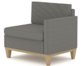
Right Arm Facing Chair W32" D28.5" H33" AL C005