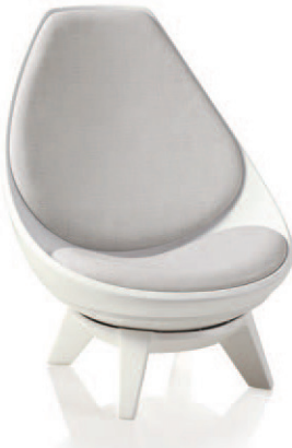
Cottonwood Poly Shell/Base