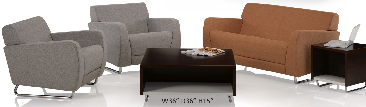
W36" D36" H15"