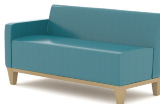
Left Arm Facing Loveseat W61.5" D28.5" H33" ALII LS01