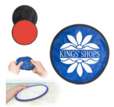
COLLAPSIBLE FLYER AROUND $1.75