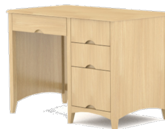
Student Desk 3 Drawer-Single Ped 24x30x42 PT D30R3