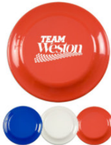
9" SOLID FLYER AROUND $1.49