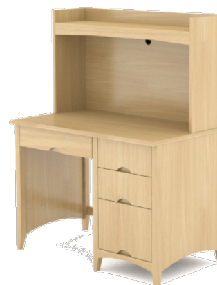
Student Desk Hutch Right Ped-4 Drawer 24x41x10 PT HUTCH 0900