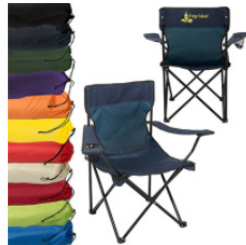
CAPTAIN'S CHAIR AROUND $24.00