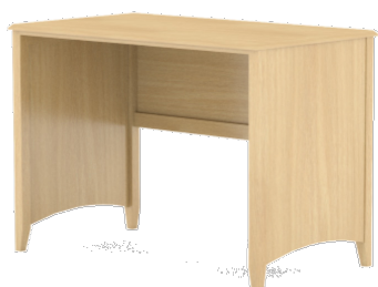
Student Desk No Ped 24x30x42 PT NPD DSK0300