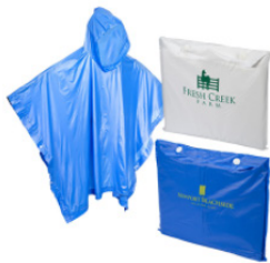
HEAVY DUTY PONCHO AROUND $3.19