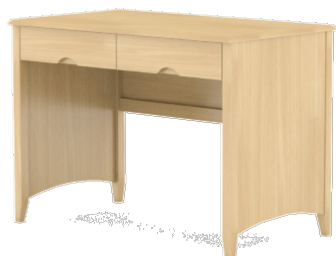
Student Desk No Ped-2 Pencil Drawers 24x30x42 PT NPD DSK0400