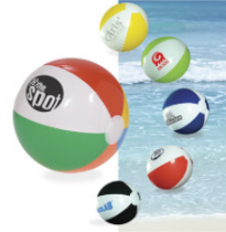
CLASSIC BEACH BALL AROUND $1.50