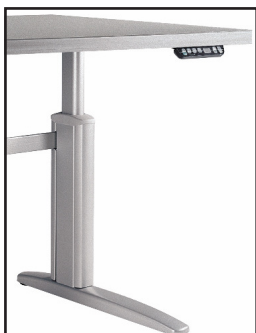
Electric Height Adjustable