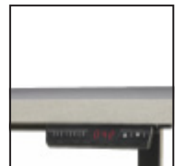
Unobtrusive Controls - easily and smoothly adjust tables under load. A deluxe option also displays the height and stores presets.