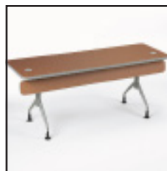
Modesty Panels - are available in quick-release or folding varieties that can be detached or swing out of the way when tables are stored.