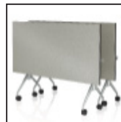
Nesting Tables - allows them to be stored more efficiently than if they were upright, without any risk of tabletops contacting the floor.