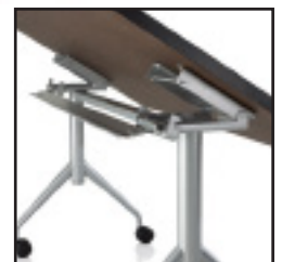
Single Bar Flip Action - makes transporting and storing the tables a single-handed proposition.