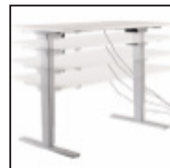
Height Adjustment - from 26"-52" can be made by dual-motor L-Bases.