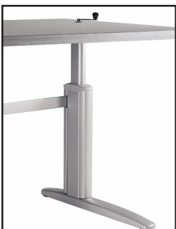
Crank Height Adjustable