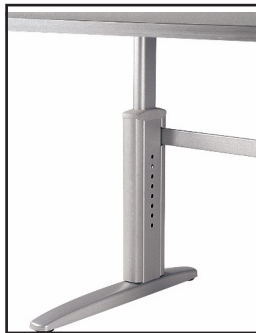
Pin Height Adjustable