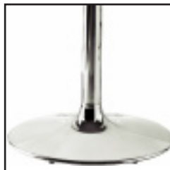
Disk Pedestal Base - features a 4" column composed of .04" thick steel with a welded